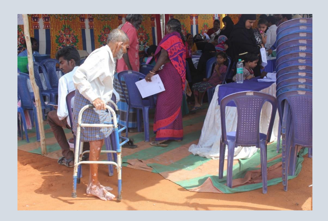
Enabling better public health in India