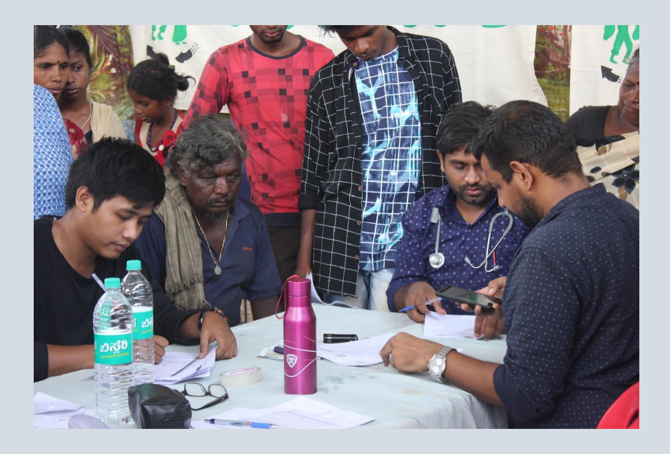
Enabling better public health in India